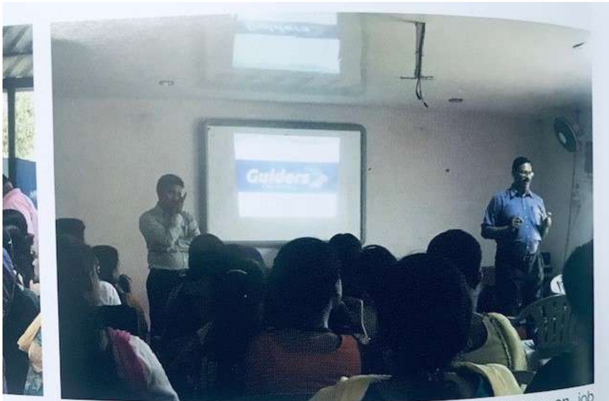
Guiders International conducting career guidance classes on job opportunities in the field of Aviation and Tourism