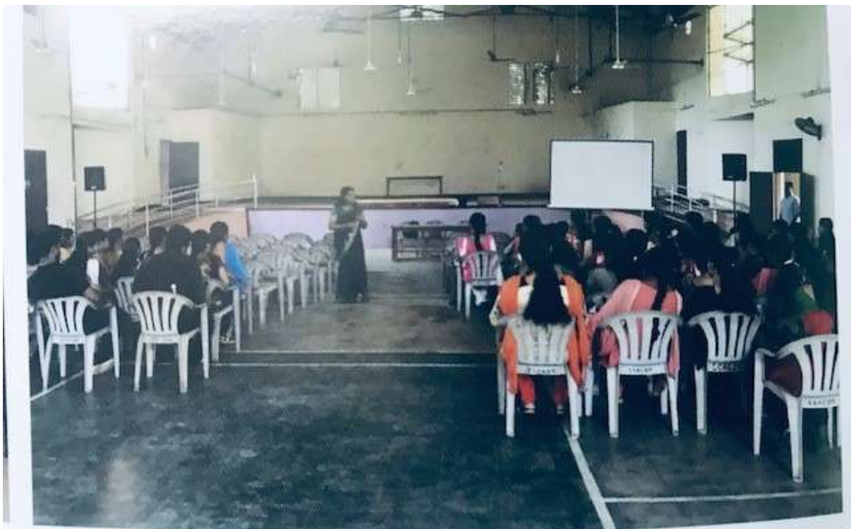
3 Training and registration with District Employability Center, Government of Kerala on 9-2-18. 25 students of final year BA/BSc registered