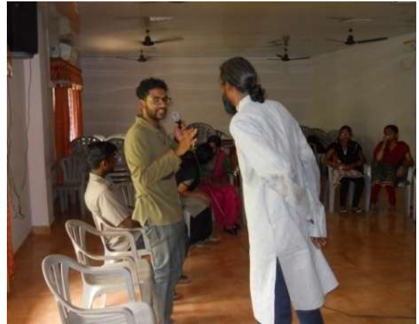
WWS Mentee Interacting During Session