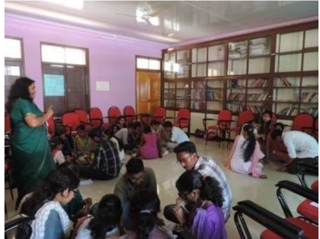
Mentees During the Training Session