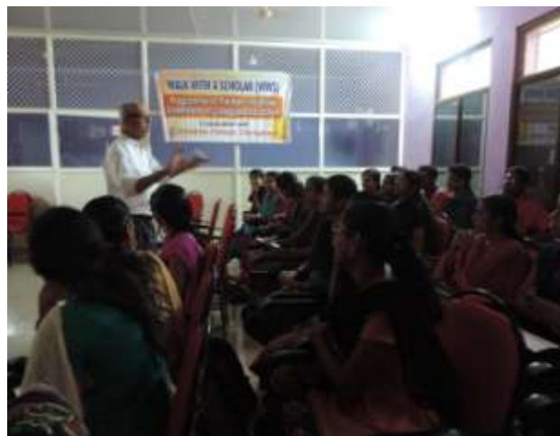
Mentees Interacting During the Session