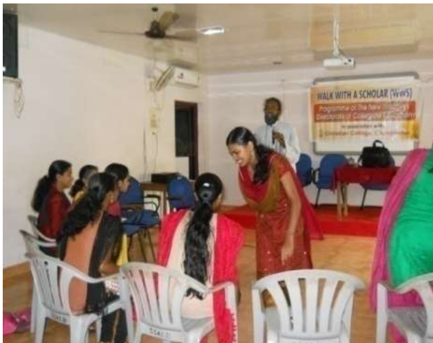
WWS Mentee Interacting During Session