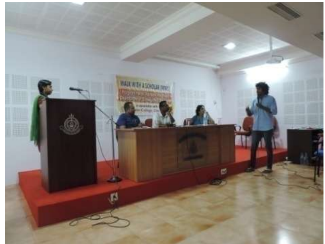
Audience Asking Questions during the Debate