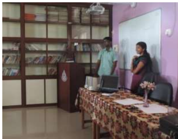
Mentees Interacting During the Session