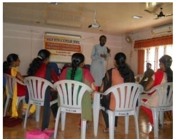
WWS Mentee Interacting During Session