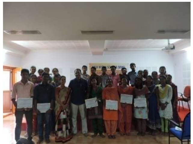
WWS Mentees with Winners of Debate Competition