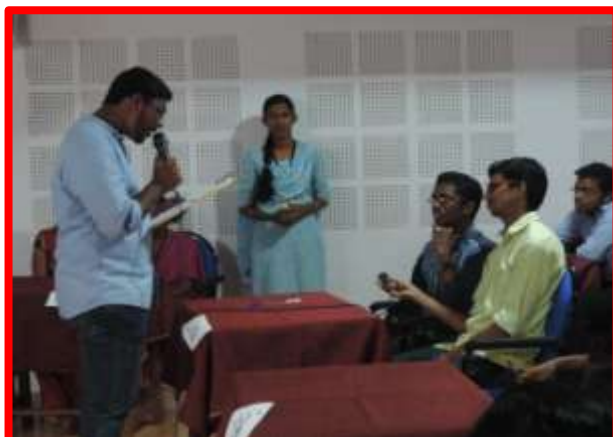
Rapid Fire Round