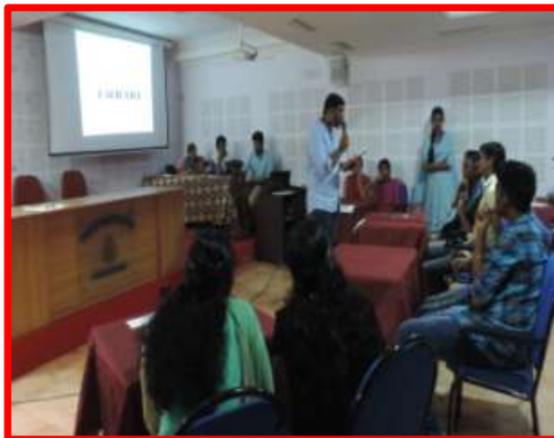
The Quiz Master