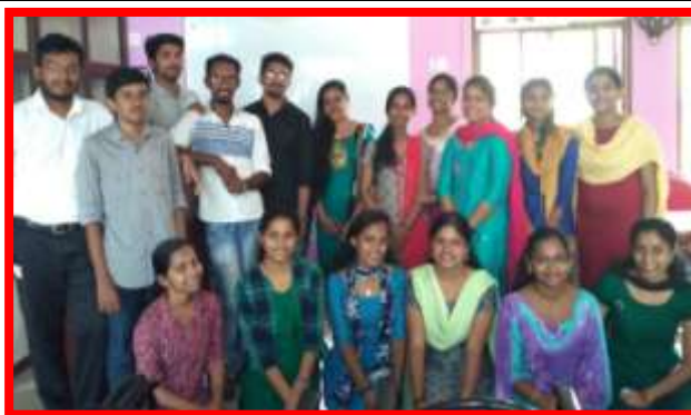
WWS Alumni Meet 2018