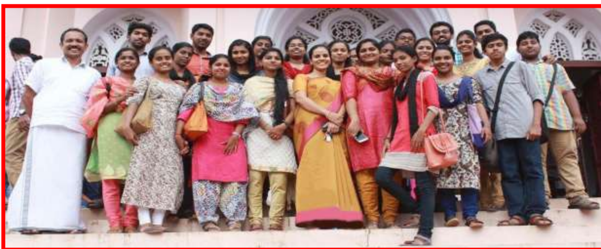
Mentees and Mentors in front of the Venue after the Talk