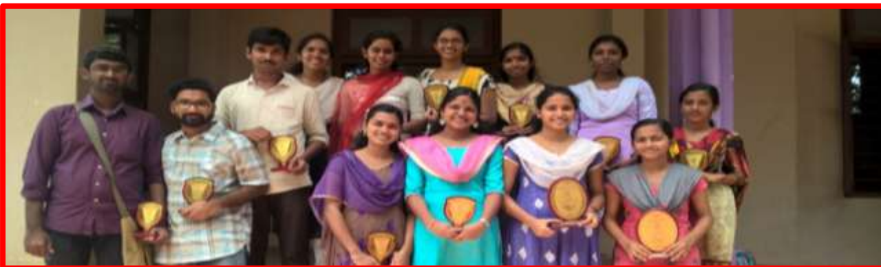
Outgoing Mentees of the 2014-17 batch who received A Grade