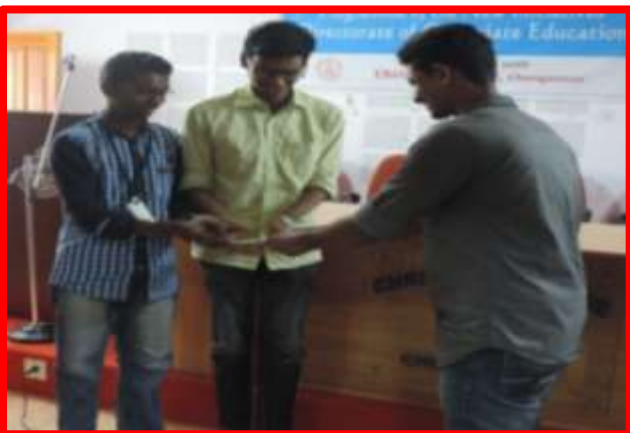
The First Prize Winners