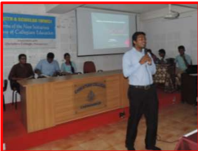
Explaining the Rounds of the Quiz