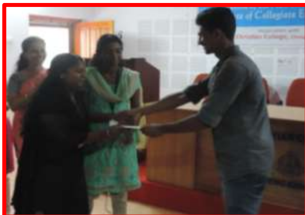
The Second Prize Winners